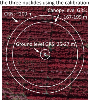
Figure 2. Footprint area of the CRN system, and the GRS detectors at ground- and canopy level. The values are the diameter of the footprint.

GEOLOGICAL SURVEY OF DENMARK AND GREENLAND - GEUS